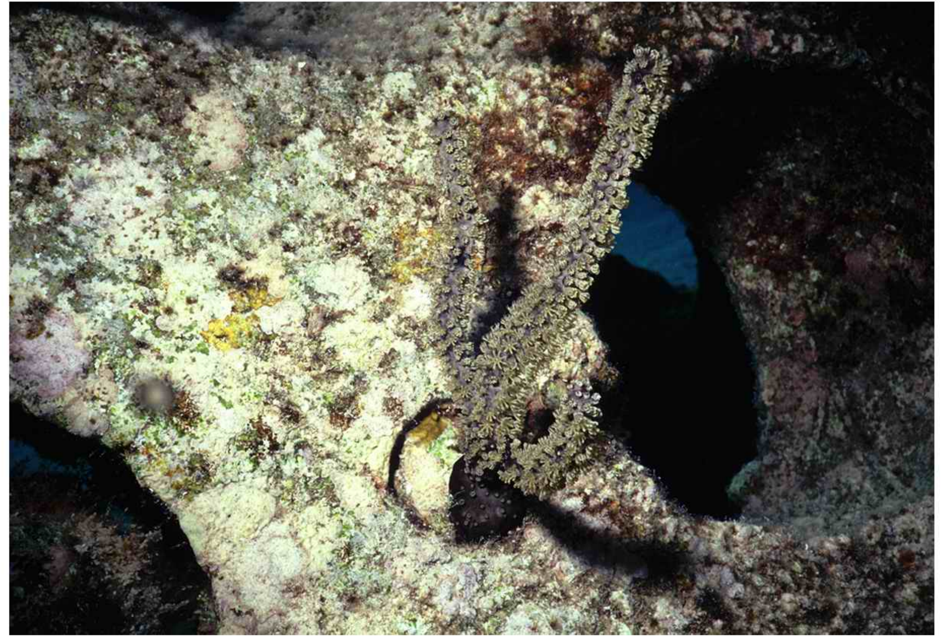
Purple Sea Rod Note coral growth on plug base